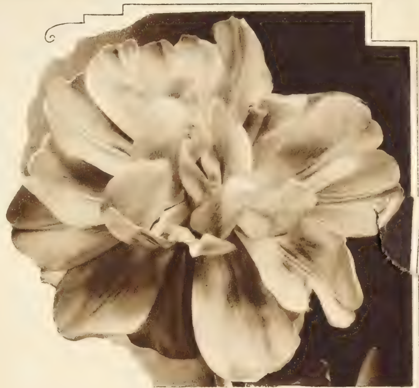
HENDERSON'S SUPERIOR DOUBLE EARLY TULIPS